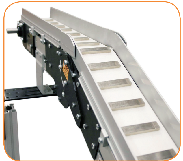
Available on LPZ (Z-Frame) Conveyors